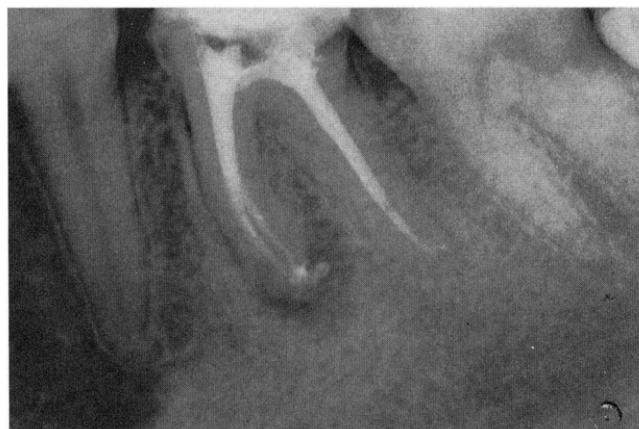
FIG 3. A postoperative radiograph reveals a densely packed root canal system.

typically works to unwind, loosen, and elevate the fragment into the previously enlarged canal. Afterward, endodontic procedures were completed, and the root canal system was packed with warm gutta-percha using the vertical condensation technique (Fig. 3).