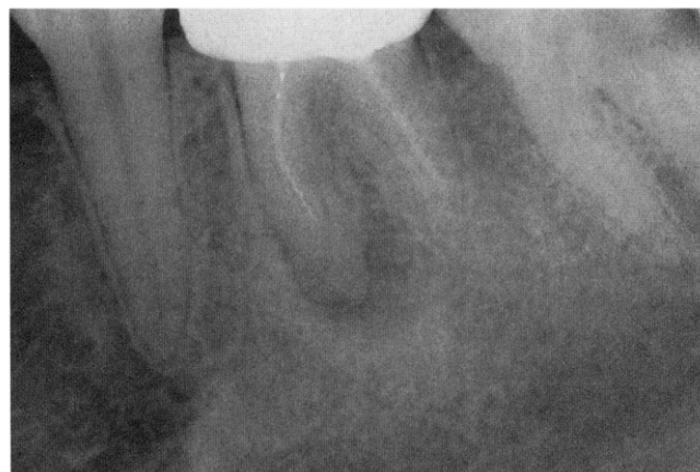
FIG 2. Preoperative radiograph of a mandibular right first molar demonstrates a mesial root with an apical pathology, a broken instrument at its middle third, and an underfilled distal canal.

A 30-yr-old male was referred for the retreatment of mandibular right first molar. Radiographs showed a broken file in the mesial root with an apical lesion and an underfilled distal canal (Fig. 2). After the crown was removed, tooth isolation and an access cavity were accomplished. Xylol was used to soften the old filling material, which was totally eliminated from distolingual and mesio-buccal canals and from the mesiolingual canal coronal to the broken instrument. A shortened #10 file was used to expose the end of the instrument, and the path was enlarged as described previously. Before using the modified spreader cotton pellets were placed over the other orifices so that the retrieved instrument would not enter another canal. The ultrasonic tip was placed in close contact with the remnant of the file for ~1 min. This activity